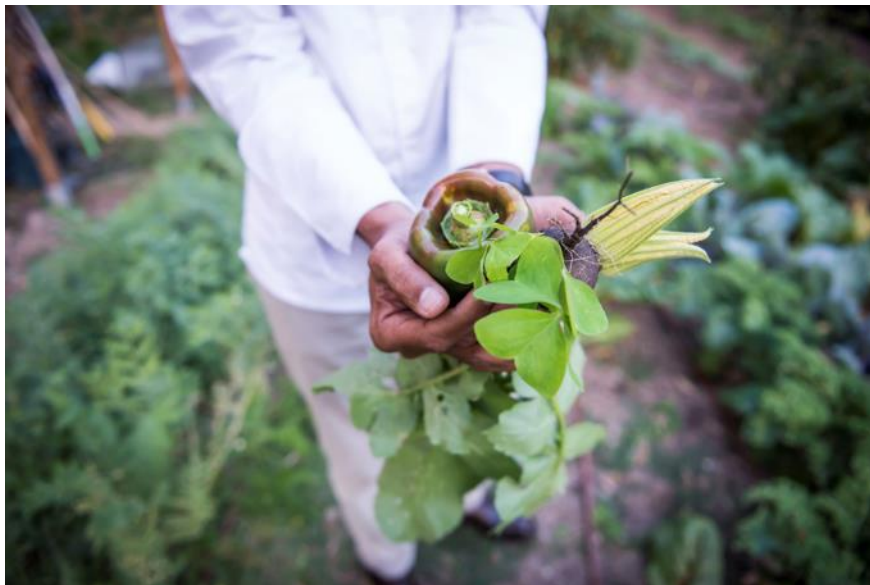
The Monte-Carlo Bay Hotel & Resort organic vegetable garden

A charter has also been drawn up with "Mister Good Fish", which enables the chef to respect marine resources thanks to a list of all the species recommended by season. For example, no bluefin tuna on the menu because it is a protected species, or no scallops in summer. However, customers will be able to discover swordfish or even whitefish, which are still little known, on the menu.