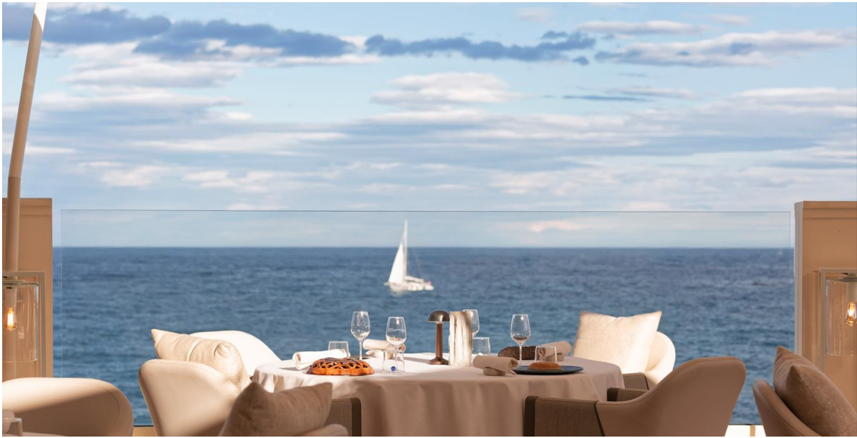
The Blue Bay terrace with panoramic view of the Mediterranean Sea and the sandy-bottomed lagoon