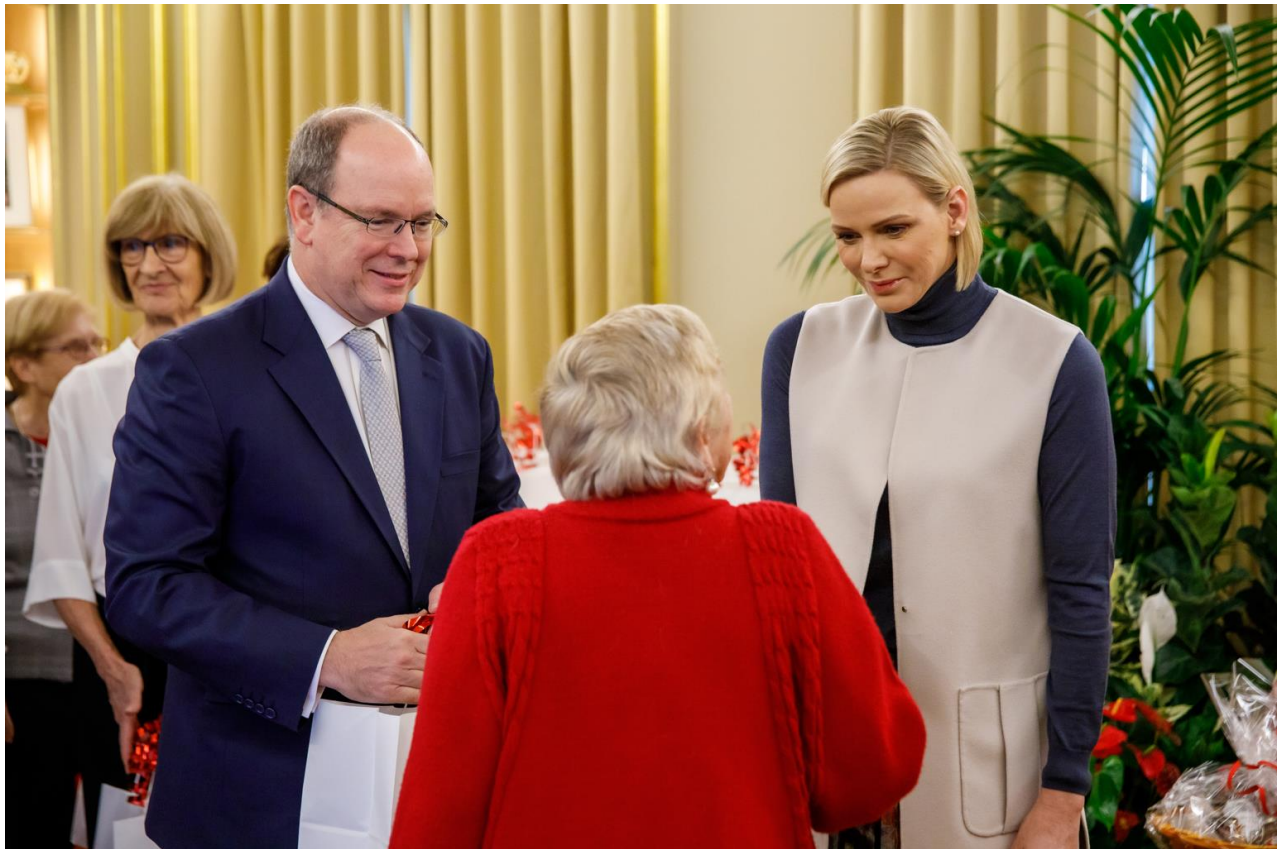
Monaco national day