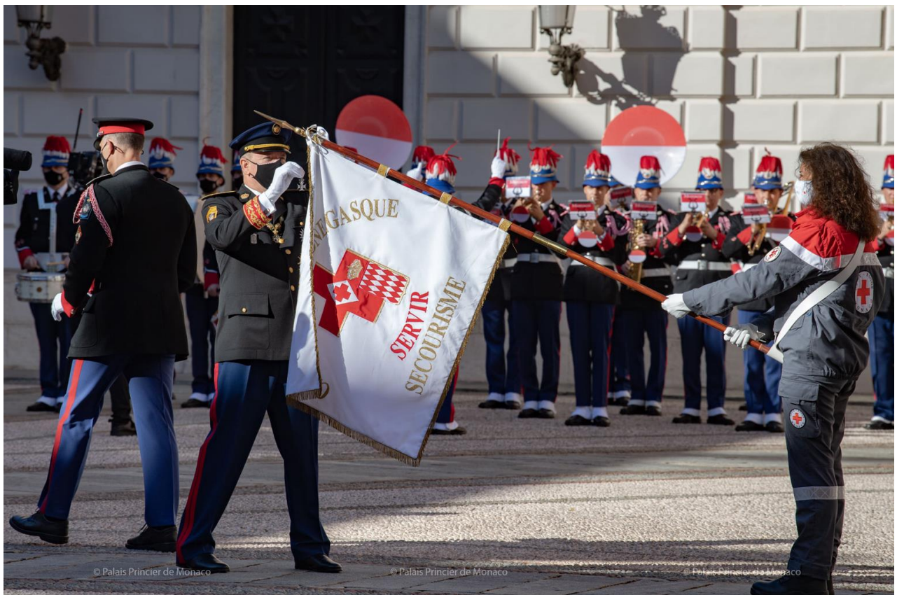
Awarding of the Ordre de Grimaldi to the Monaco Red Cross