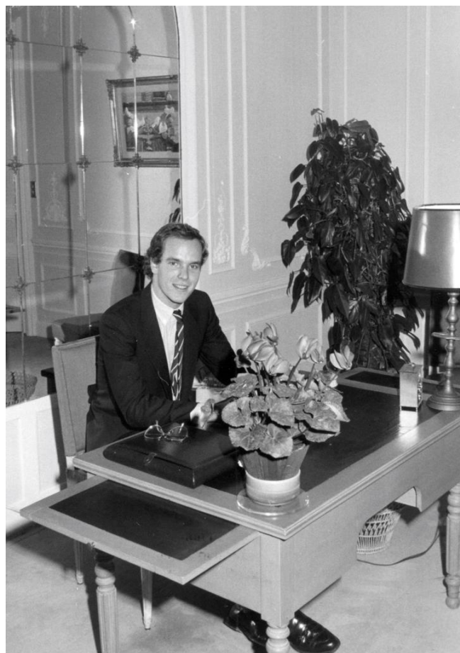
H.S.H. Prince Albert II, President's office. Office of Princess Grace

Thank you, Your Highness, for the 40 years you have dedicated to assuming the Presidency of the Monaco Red Cross!