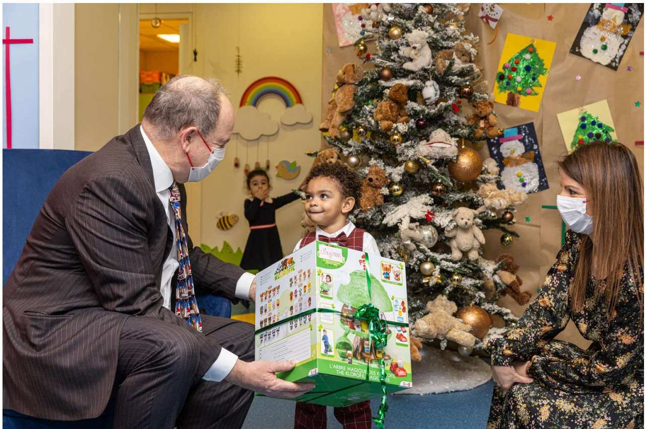
Youth, daycare centre