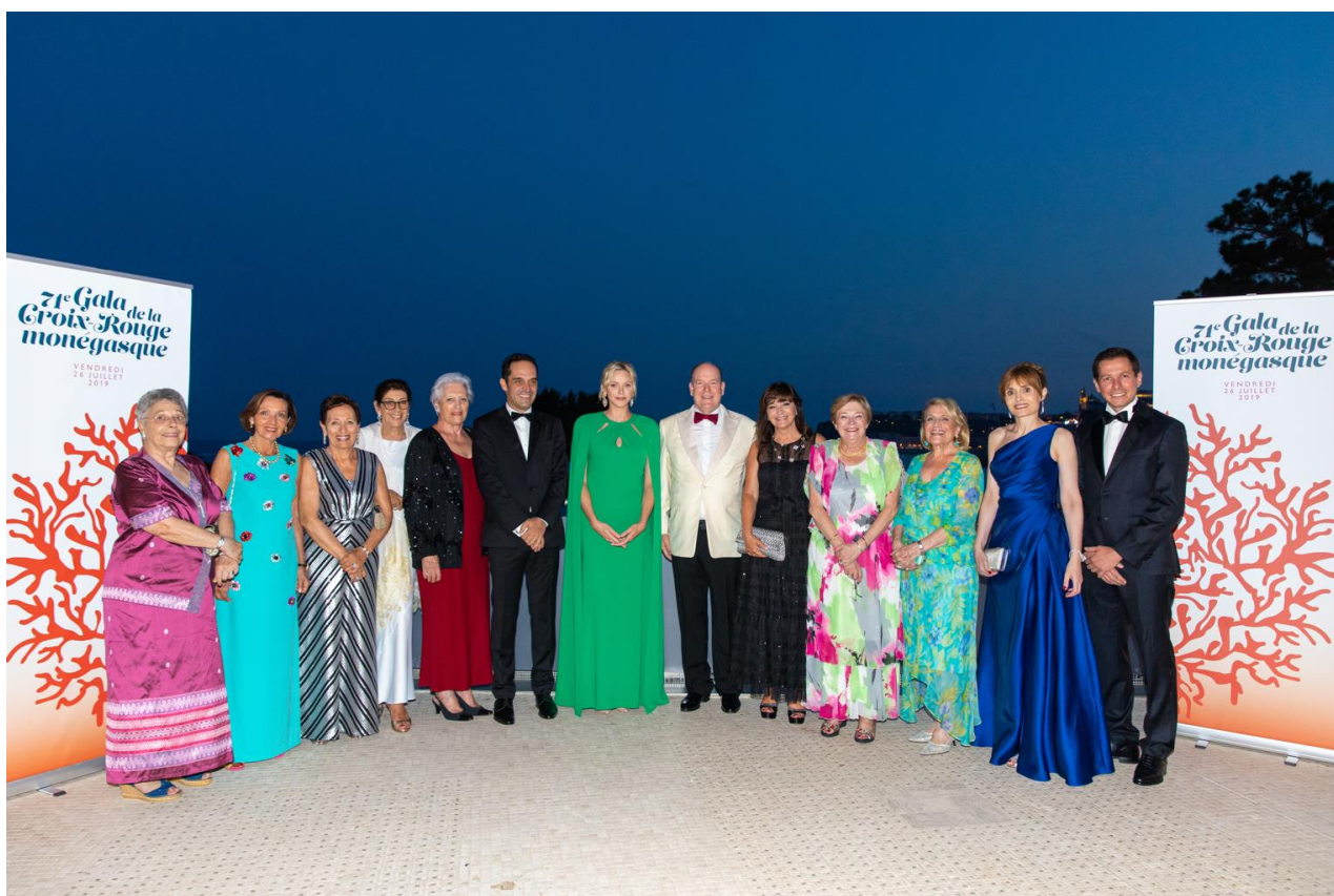
2019 Monaco Red Cross Ball, the Board of Directors