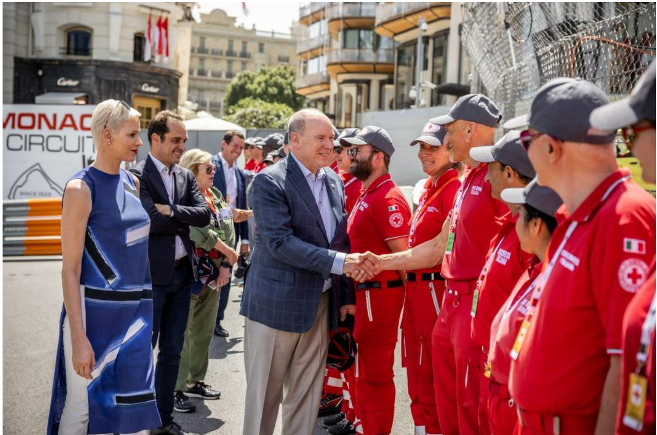
First Aid, Track of the Formula 1 Grand Prix