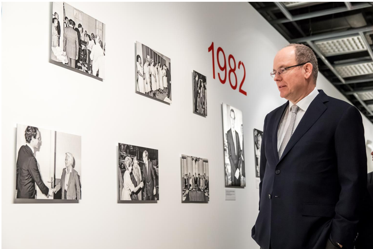
Exhibition of the 70th anniversary in 2018, Exhibition Room on quai Antoine-1er in Monaco.