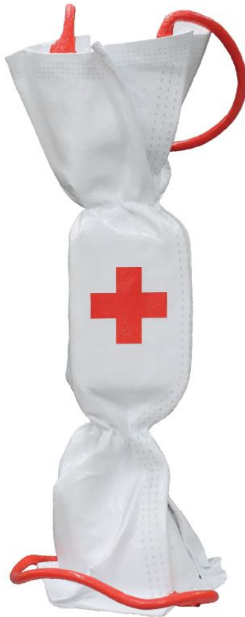
"Wrapping Candy Mask" 2021 plexiglass sculpture 190x75 cm on an aluminium stand 75x75 cm