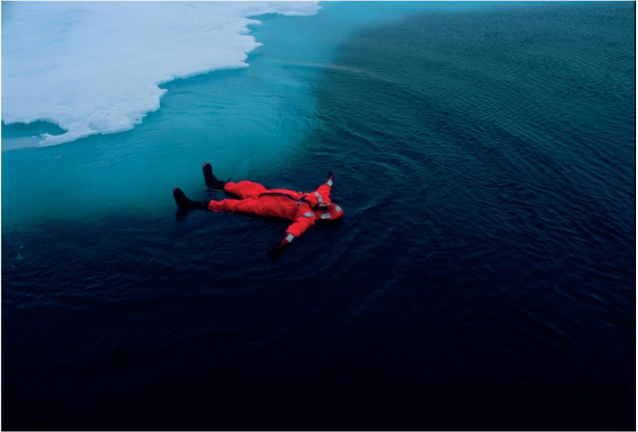
Prince Albert II of Monaco in a survival suit, Artic Ocean, Svalbard, 2005 – Dimensions: 65x44 cm